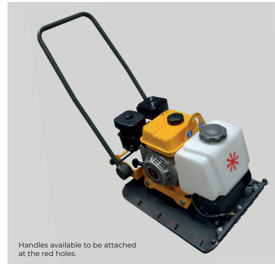
Handles available to be attached at the red holes.