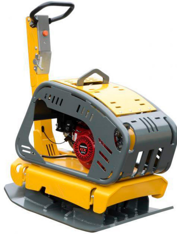
Plate compactors with a reversible drive from 150kg to 500kg. There is availability of different engines and other options according to the needs of each client. Driving assembly makes operation easy.